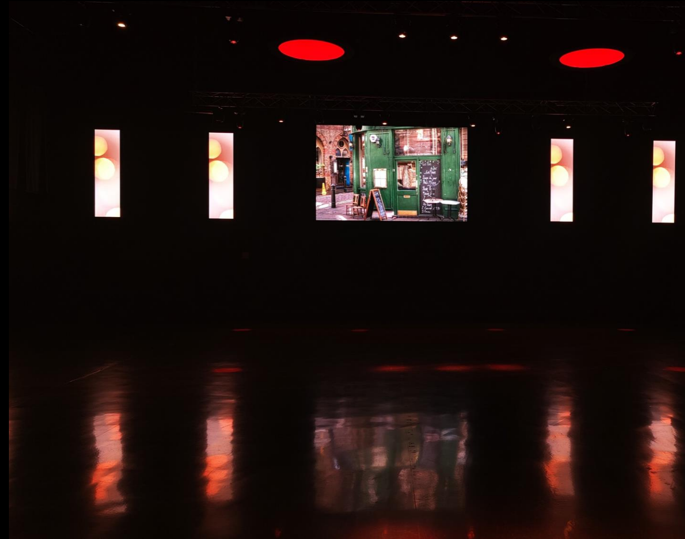
LED wall – optional