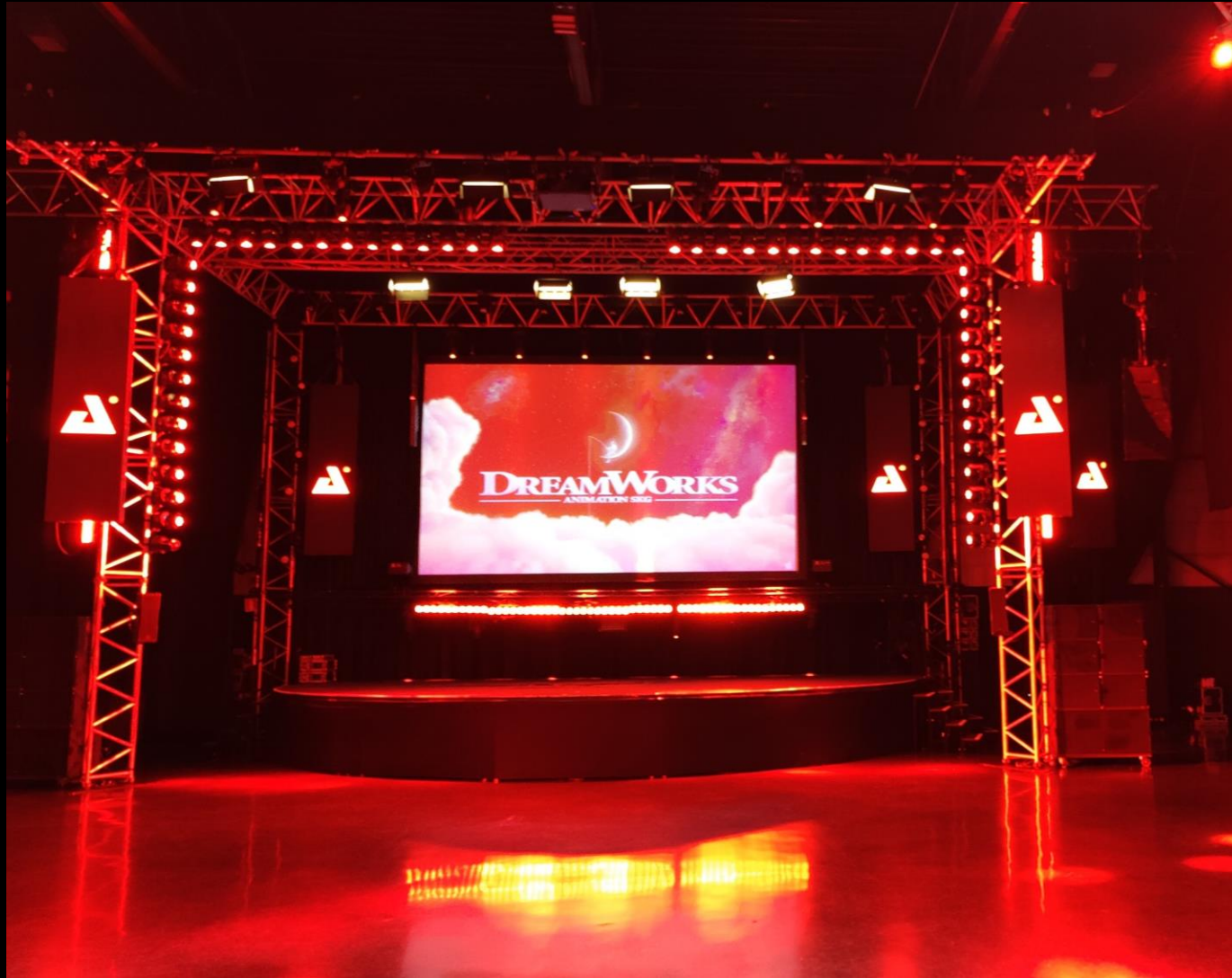
LED columns stage & reception: included